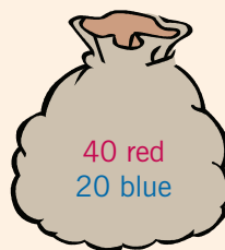
Bag y Total = 60 marbles