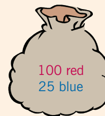
Bag z Total = 125 marbles

Ms. Rhee shook each bag. She asked the class, “If you close your eyes, reach into a bag, and remove 1 marble, which bag would give you the best chance of picking a blue marble?”