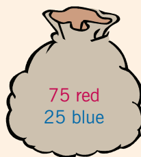
Bag x Total = 100 marbles

Ms. Rhee’s math class was studying statistics. She brought in three bags containing red and blue marbles. The three bags were labeled as shown below: